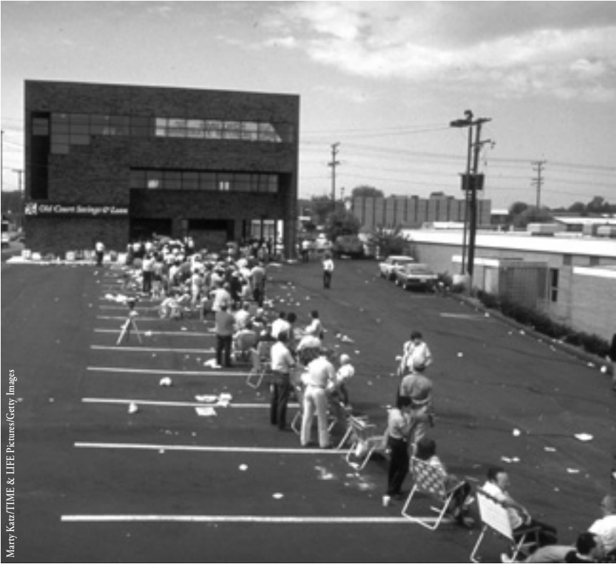
Long lines of depositors, such as this one outside of an Old Court Savings and Loan location near Baltimore in 1985, seemed more like a page from the Great Depression or the early 1900s and not something America would face in the late 20th century.