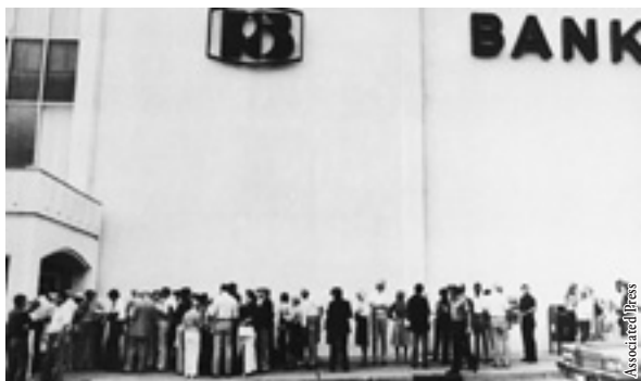
Hundreds of depositors lined up outside of Penn Square Bank after it failed over the July 4th holiday weekend in 1982. Because of the small bank's connections to larger institutions, its failure had far-reaching implications.

noteworthy – and far-reaching – banking failures of the period: the collapse of Oklahoma's Penn Square Bank.