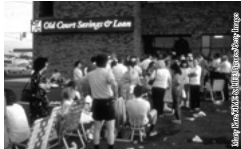
Depositors brought along lawn chairs and waited in line to withdraw savings from an Old Court Savings and Loan location in a Baltimore suburb in May 1985.

"(First Maryland) had a reputation in the industry as an easy place to get a loan,"